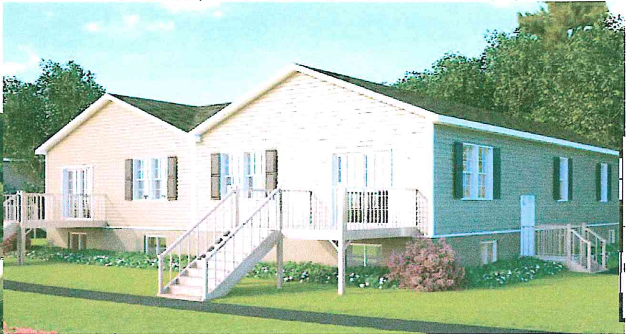
1-STORY DUPLEX OVER BASEMENT