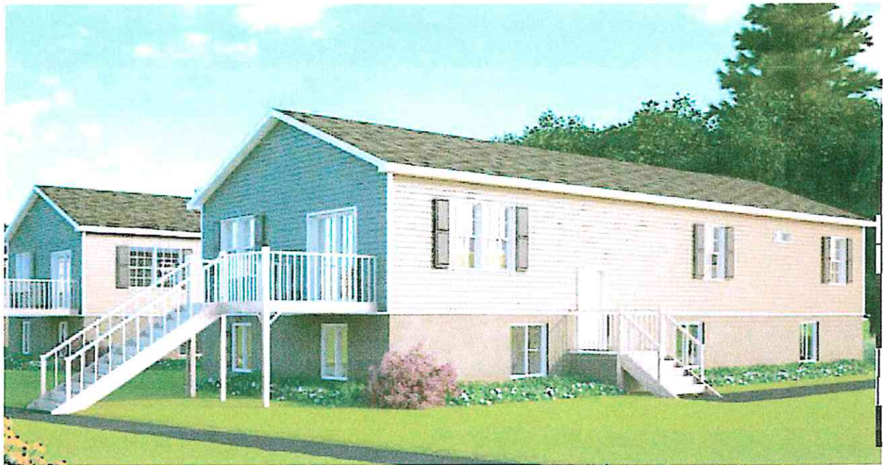
1-STORY SINGLE OVER BASEMENT