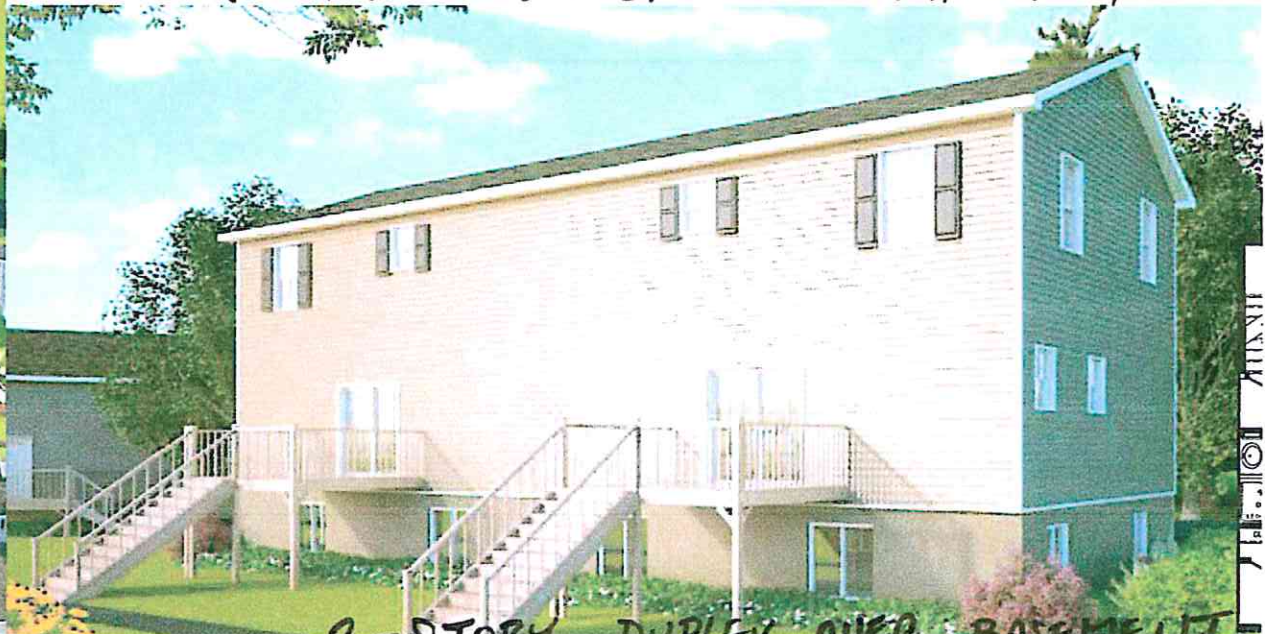
2-STORY DUPLEX OVER BASEMENT

RAL-HAL DEVELOPMENT (VENETIAN VILLAS) HEIDEN ROAD • (T) FALLSBURG